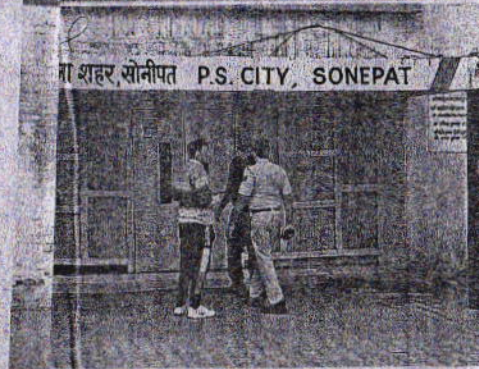
सोनीपत में स्पेशल पुलिस यूनिट बनाई।

जनसिद्ध शोषण के शिकार बच्चों की मदद के लिए प्रशासन ने उठाए नए कदम